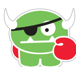
TARTAR THE TERRIBLE